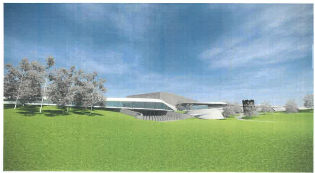
VIEW FROM LOWER BASIN SCALE 12 = 127