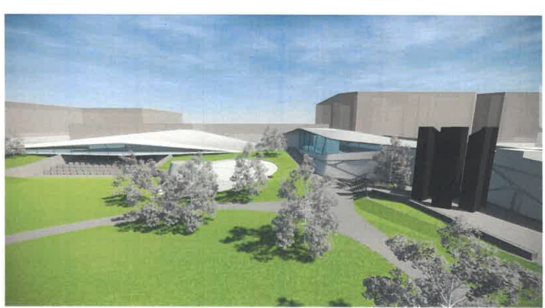
VIEW FROM EAST PARK SCALE: 12 - 1-4" 2